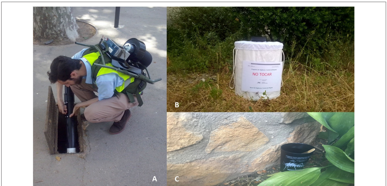
FIGURE 1 | Sampling methods used in this study including direct aspiration in mosquito resting areas (A), BG-Sentinel traps (B), and ovitraps (C).